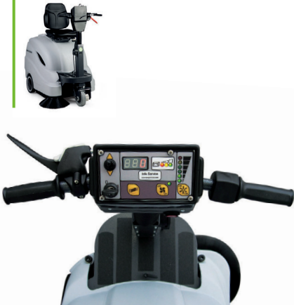
Maximum comfort and extreme ease of use