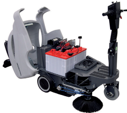
Easy access to internal components