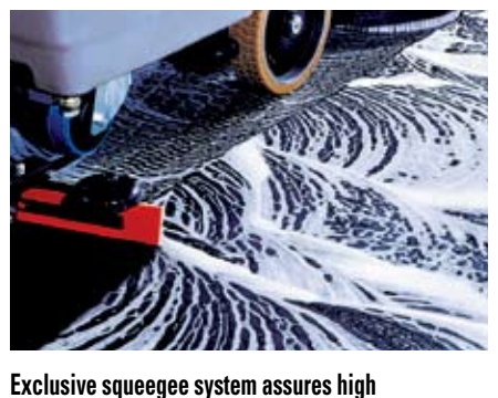
performance at low cost Incomparable drying results even on the most difficult surfaces thanks to a very unique design.