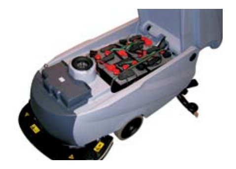
Extensive running time Extremely large battery compartment allows batteries of up to 5 hours running time.