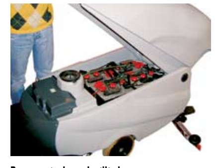
Recovery tank can be tilted Easy to rinse and clean thanks also to smooth internal finishes.