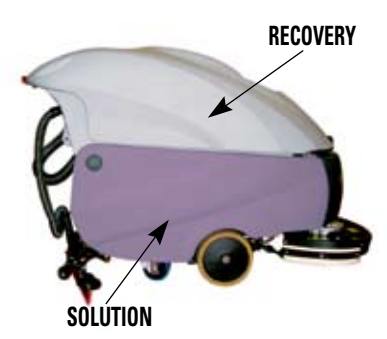
Large tank capacity in minimum external space 26-29 Gallon (100-110 L.) capacity tanks make this model very unique in its category.