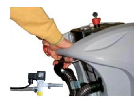
Solution control with automatic stop Saves water and save chemicals. Solution flow stops and starts upon brush command.