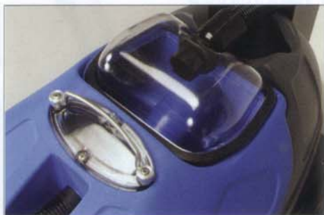
Clear lid for monitoring of recovery.