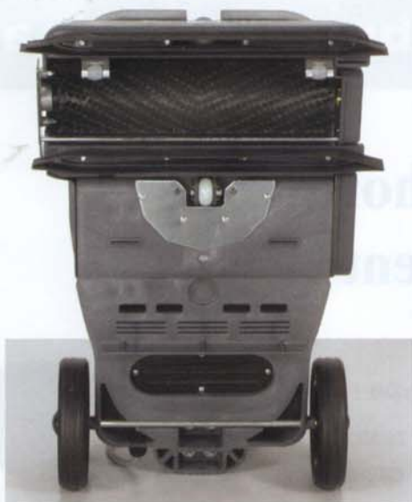
Dual squeegee system and cylinder brush for cleaning all hard floors.