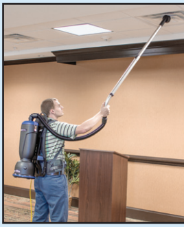
Aluminum telescoping wand allows easy access to a wide variety of areas.