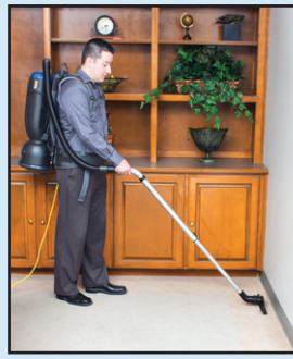
Perfect for cleaning carpet, hard floors and above floor cleaning.