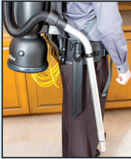
"Hands Free" system allows storing of the tools, including the wand, right on the belt for user convenience.