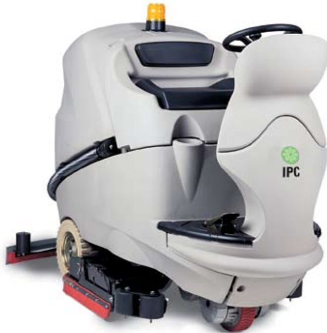
Cylindrical Brush Version