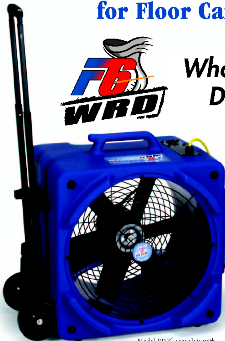
Model PDF6 complete with telescopic handle and wheels.