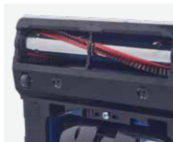
METAL BRUSHROLL WITH REPLACEABLE BRUSH STRIPS