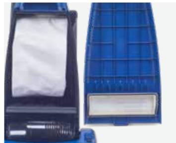
HEPA BAG AND HEPA EXHAUST FILTER, AND CLOTH SHAKE-OUT BAG