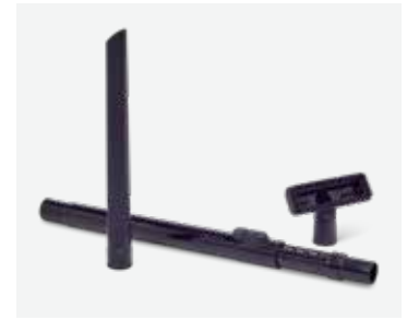
INCLUDES CREVICE TOOL AND DUSTING/FURNITURE COMBO TOOL