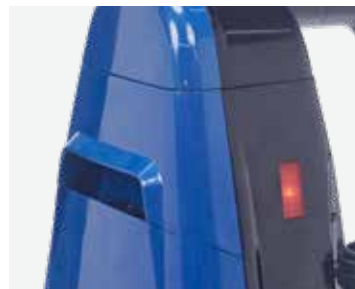
CHECK BAG INDICATOR