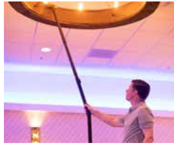
TELESCOPIC WAND AND TOOLS FOR 16' REACH