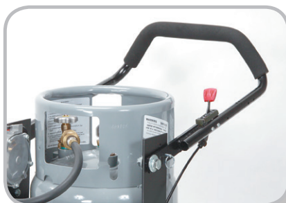
Handle adjusts for operator comfort