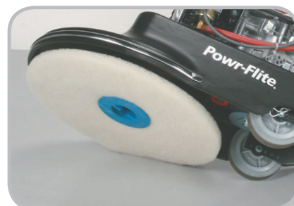
Tilt design for easy pad changes

Powr-Flite® high performance propane burnishers provide first class results year after year. At the heart of each unit is the powerful 17 hp Kawasaki® engine which has been the choice of professionals for years. These powerful motors produce 1850 RPM and are mounted on rugged cast aluminum decks. Pads are mounted to flexible pad drivers which conform to the unique undulations in every floor, preventing burn spots. Adjustable and ergonomically designed handle reduces operator fatigue.